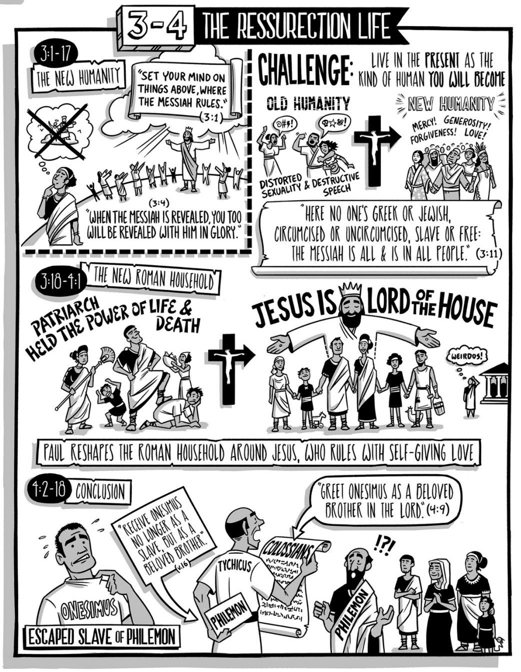
created by the Bible Project